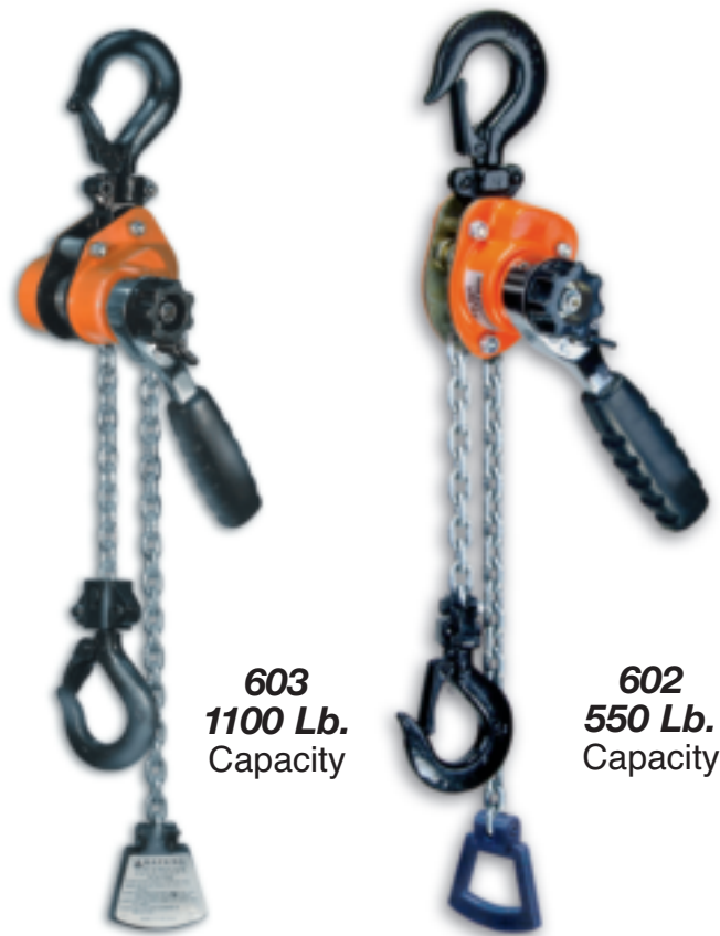
5 Ft. & 10 Ft. Lifts