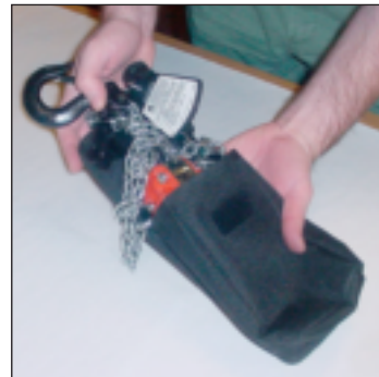
Convenient Carry Bag - Product Code # 0212

Our compact Mini-Hoists perform just like the larger hoists, except they're small enough to fit in the palm of your hand.